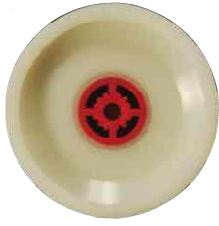
Aqua-loc patented Flow Regulating Device.